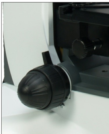
Focus safety stop

The Brunel SP500 is a superb laboratory specification trinocular microscope with excellent IOS infinity corrected coated plan achromatic objectives. The SP500 is a large instrument with a very elegant and modern design, and is the latest addition to our range. There is an excellent range of accessories including phase contrast and dark ground systems.