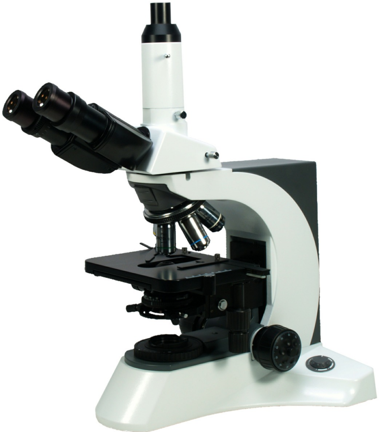
Brunel SP500 Infinity Microscope