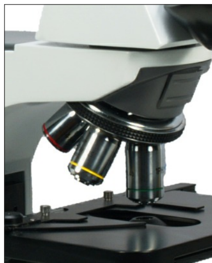
Infinity Corrected Plan Objectives

The die cast microscope body is well balanced and extremely stable. The trinocular head is 30 degree inclined and fully rotatable, with the option of 100% light to the binocular eyetubes or an 80%/20% split to the trinocular phototube. The SP500 has a coaxial coarse and fine focus system with tension adjustment and a focus safety stop. The mechanical stage has a double vernier scale for specimen location, and has low position coaxial controls. The stage area is 175 x 145mm with a 75 x 50mm moving range. There is a double filter slot beneath the microscope head for polariser and filter insertion.