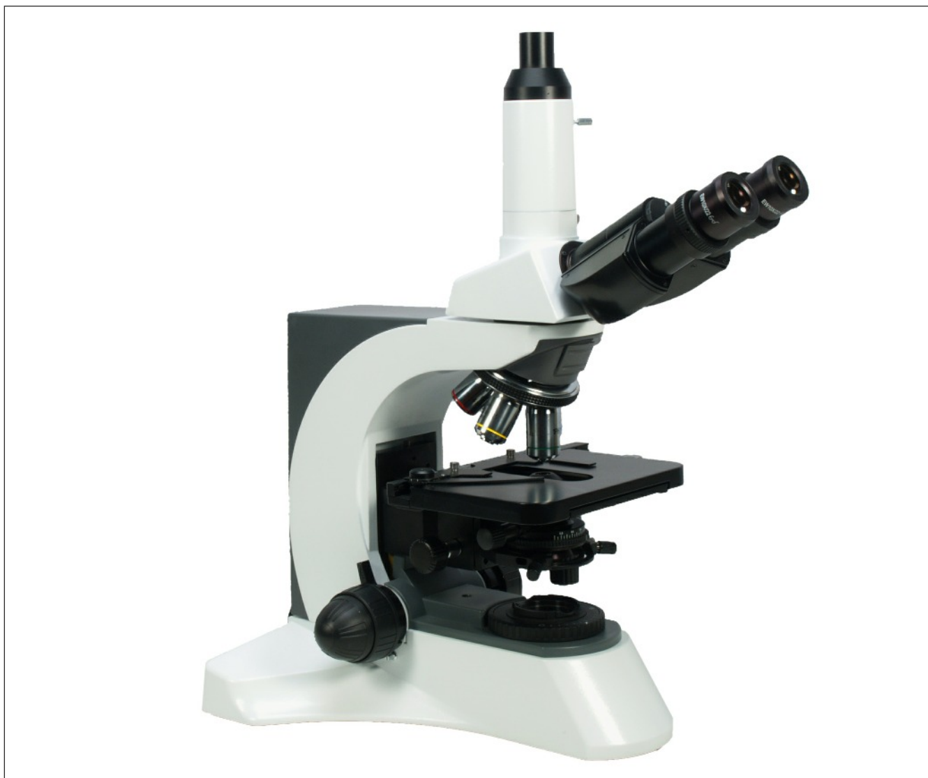
SP500 Infinity Microscope